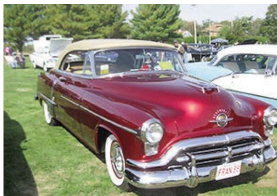
This beautifully restored Oldsmobile 88 was one of 200 cars on display during the 2016 SHARE Foundation Classic Car Show and Flea Market.

In addition to the car show, a variety of vendors will be on hand selling their wares, with set-up beginning at 7 a.m. If you are interested in turning some of the stuff in