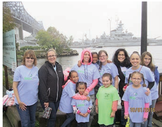
A little rain couldn't dampen the spirits of these dedicated walkers at SHARE Fun Walk 2016!

The waterfront destination is perfect for a day of fun, sightseeing and, most especially, helping a worthy cause. The carousel is the same merry-go-round housed at Lincoln