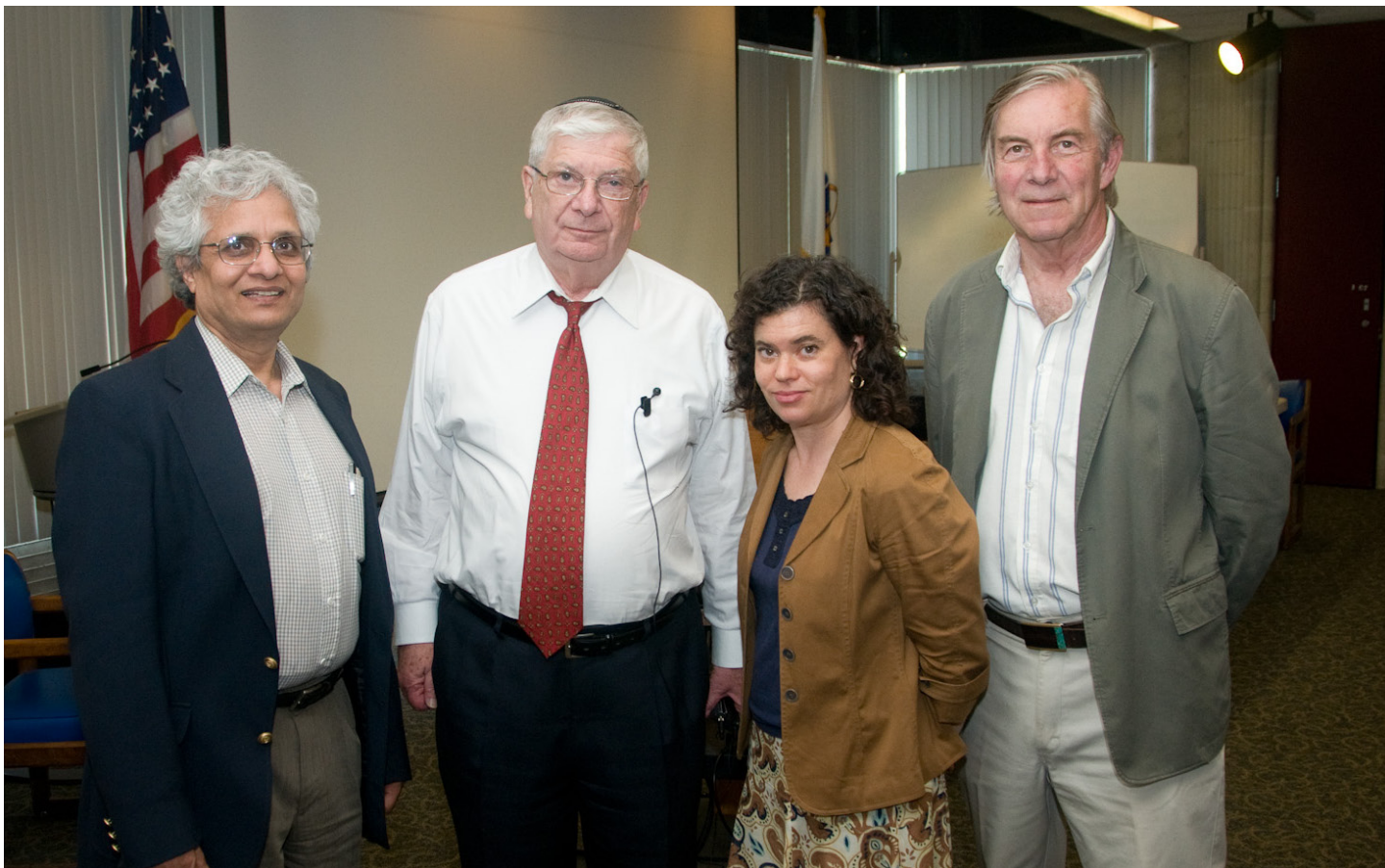
The Center for Jewish studies and the Center for Indic Studies explored the unknown Jewish experience in India