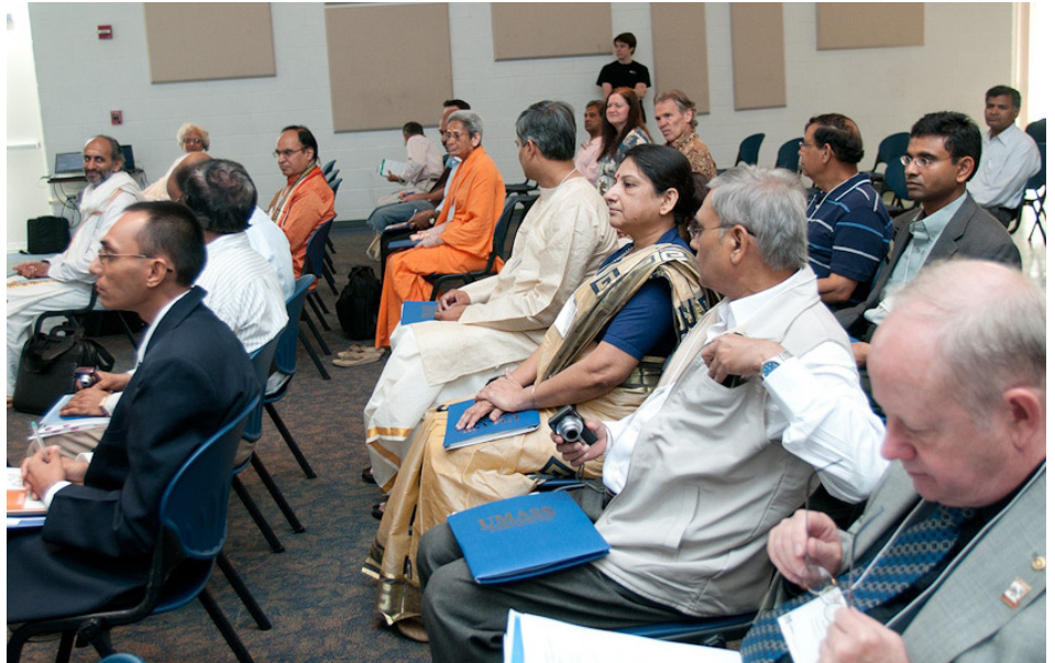
The audience immersed in the proceedings of the conference