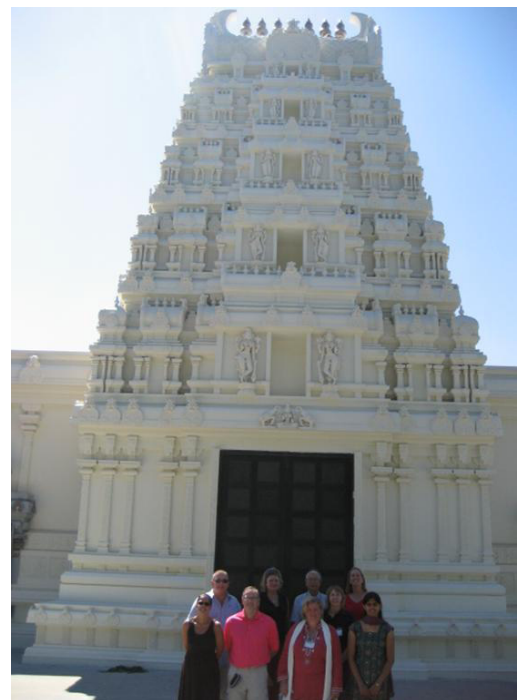
Teacher trainees at the Lakshmi Mandir in Ashland, MA

The 2010 Uberoi Foundation summer seminar for classroom teachers on the topic of “Teaching Dharmic Traditions” facilitated by the Center for Indic Studies was a well received and effective strategy to advance education of the Dharmic traditions in American schools. Importantly, the pilot program provided vital feedback for planning our future workshops. The Center for Indic Studies anticipates that yearly educational workshops will enhance and enrich the teaching of Indic Studies in the USA.