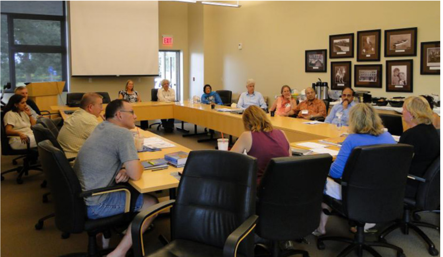
Teachers involved in various discussions as part of their training program.

On the final day of the training program, the teachers were taken to a Hindu temple for a first-hand cultural experience and an extended discussion on Dharmic practices. This field trip was very well received, and provided an excellent chance to interact with practitioners on their own turf and a greater opportunity to understand the meaning of concepts and practices such as puja, sadhana, and mantra.