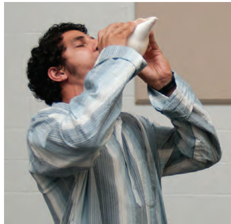
The Conch Blowing

Congress has expanded to include all major schools of Vedanta such as Advaita, Visistadvaita, Dvaita, Suddhadvaita, as well as Hindu, Buddhist, and Jaina Darsanas, Epics and Puranas, and Dharma Sastras. Recently, scholars have used Indian philosophical points-of-view to look at contemporary issues like abortion, euthanasia, war, peace, caste, race, and karma. Additionally there has emerged an on-going theme that applies Indian philosophical implications to recent developments in mathematics, life sciences, cognitive sciences, etc. At past conferences, in addition to mainstream papers on Vedanta, physicists have presented papers such as the 'Brahman of Physics'; and medical practitioners with a knowledge of the Vedas have presented papers on advances in medical research and their implications