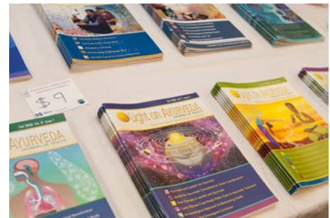
Various books, including the Light on Ayurveda Journal, on display and on sale