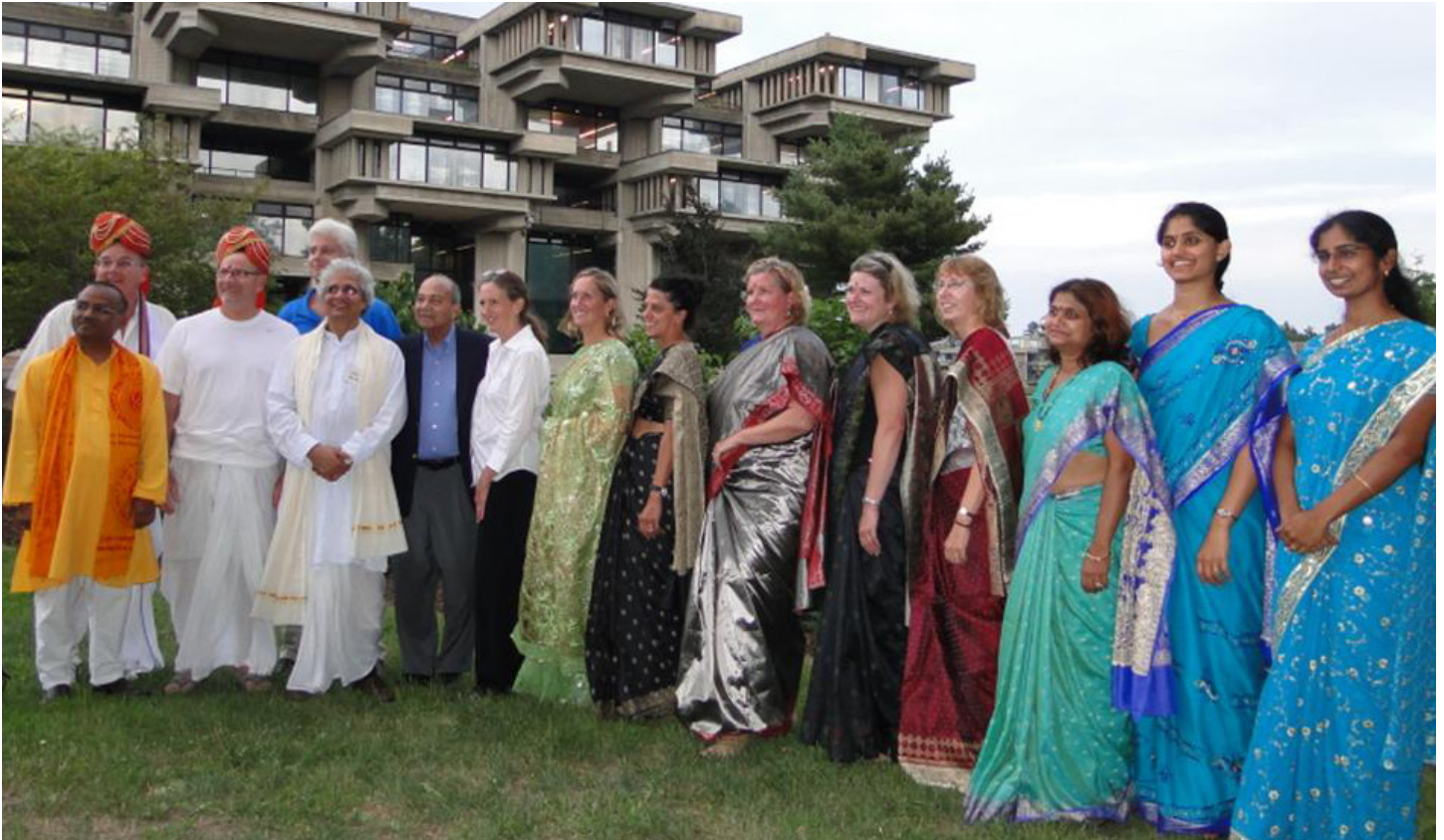
Organizers and presenters in traditional Indian dress, along with Uberoi Foundation officials on August 18, 2010