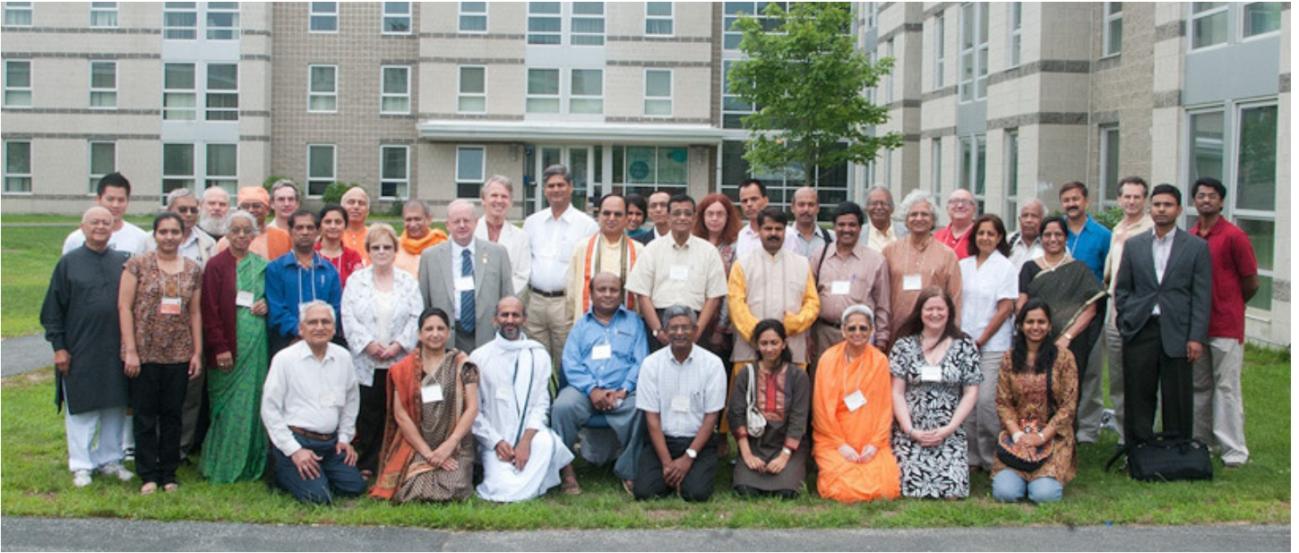
Vedanta Conference Group Photograph

The Center for Indic Studies is proud to announce that the Twentieth meeting of the VedantaCongress, the third that we will have helped to organize, will be held in New Delhi on the campus of JNU during December 28-31, 2011.