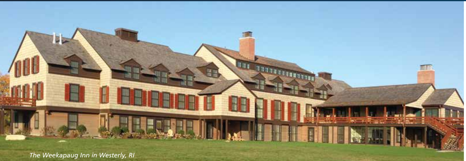
The Weekapaug Inn in Westerly, RI