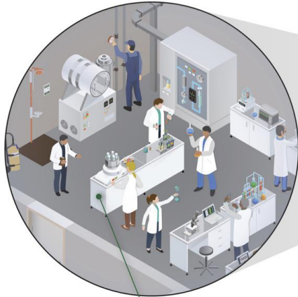
Direct costs - These expenses solely cover research and include lab supplies and equipment; salaries and stipends for researchers and graduate students; and travel costs for conducting and sharing research

The total cost of federally sponsored research includes a combination of both direct and facilities and administrative (F&A) costs. Both types of expenditures are key to an institution's ability to conduct cutting-edge research. F&A consists of the construction and maintenance costs of laboratories and high-tech facilities; energy and utility expenses; and safety, security, and other government-mandated expenses. These costs are real and research cannot be conducted without them.